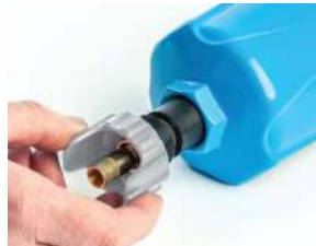
Externally Accessible Drain

Alpha deep pleated media technology delivers a step change in performance